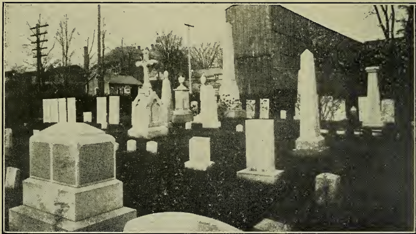
View of Newer Portion, Looking East.